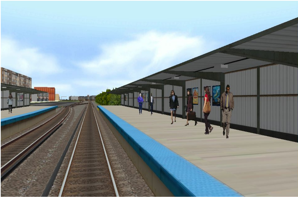
Image displays Dempster-Skokie Station